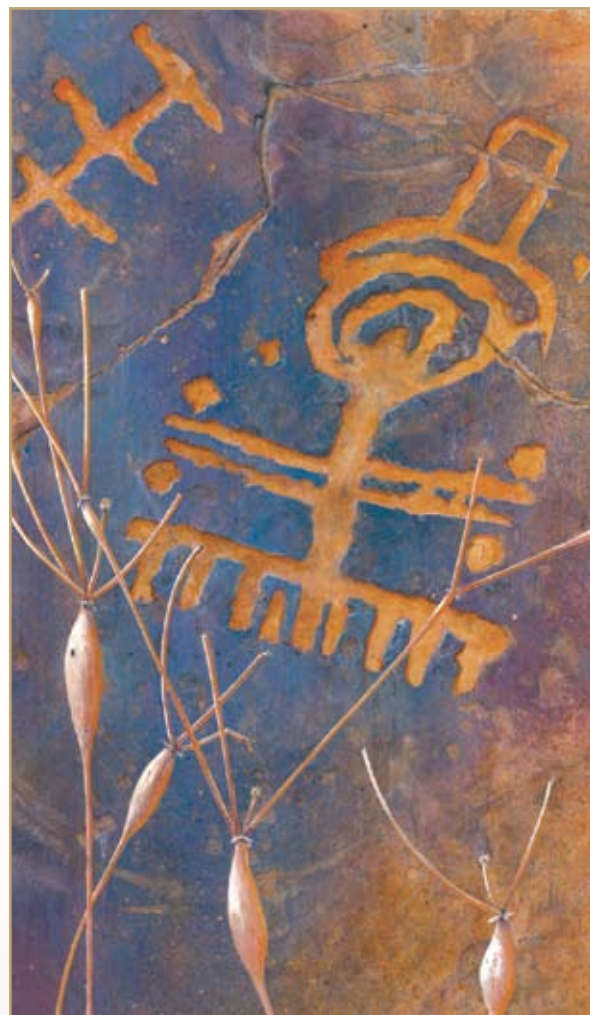
Raven's Cry (left). Archival Limited Edition print from original acrylic on masonite; s/n 250; size 10 x 10.