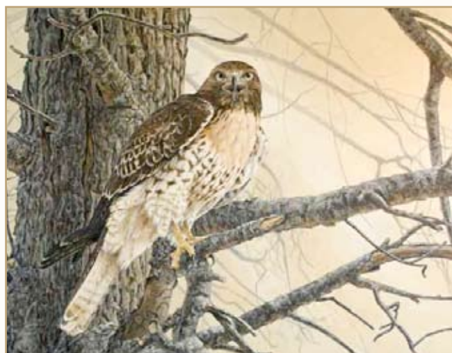
Eyes of Warning—Red-tailed Hawk. Archival Limited Edition giclée print.